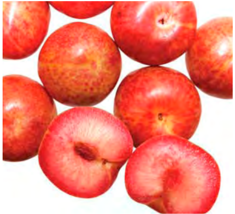
Above: Plums + apricots = Pluots.