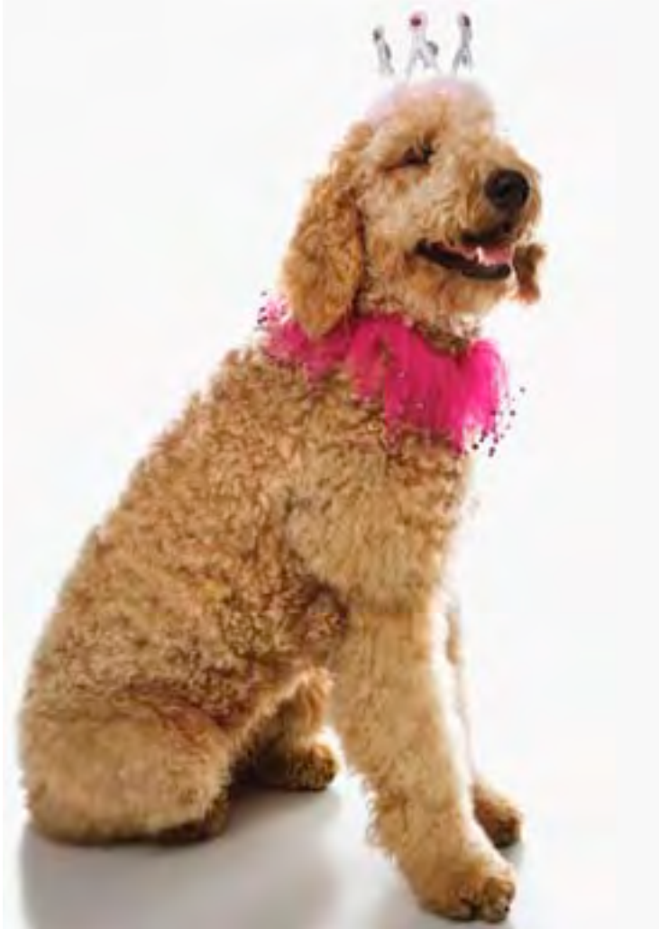
Above: Designed to shed less and to be mostly hypoallergenic the Goldendoodle (Golden Retriever/Poodle) has become a popular breed.